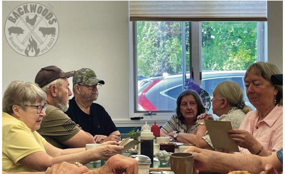
Sixteen seniors met for the May Coffee Hour at Backwoods Barbecue. Good conversation over a cup of coffee and/or breakfast is always fun and enjoyed by all who attend! See CoA page 7.