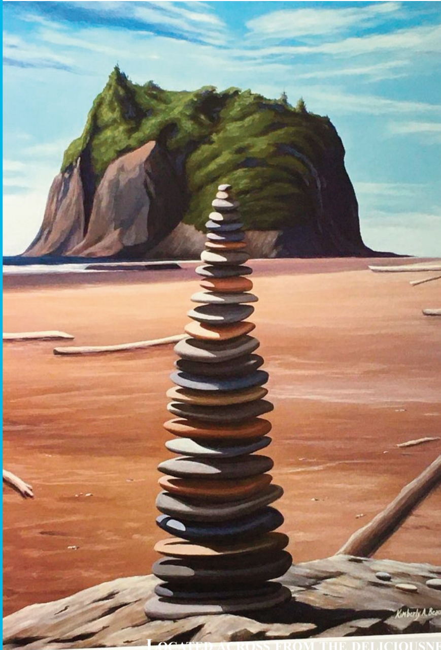
LOCATED ACROSS FROM THE DELICIOUSNESS

“Everybody born comes from the Creator trailing wisps of glory. We come from the Creator with creativity.”