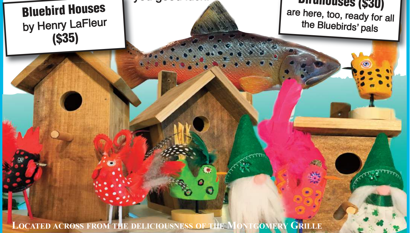
LOCATED ACROSS FROM THE DELICIOUSNESS OF THE MONTGOMERY GRILLE

Leo Zacharie's Birdhouses ($30) are here, too, ready for all the Bluebirds' pals