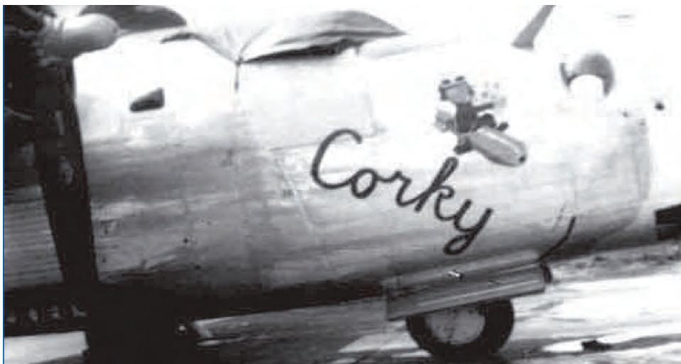
The B24 plane Corky underwent major repairs at Woodbridge, Suffolk from damage on the mission to Gelsenkirchen, Germany. She was lost 28 June 1945 in a mission to Dortmund. Corky had arrived in Shipdham in early June 1944. She flew 66 missions with many crews.