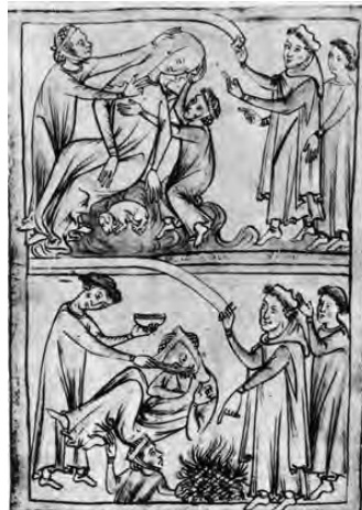
A drawing depicts the death of St. Valentine — one of them, anyway. The Romans executed two men by that name on Feb. 14 of different years in the 3rd century A.D.