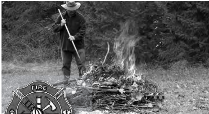
154 Main Road Montgomery, MA

Open Burning: Burning season is Jan 15 to May 1, between 10 am and 4 pm. A permit is required. Permits can be attained by calling the Fire Dept business phone, #862-4505 and leaving a detailed message with name, date you are burning, complete address and best phone# to reach you. Open burning must be at least 75 feet from any building. Brush and forestry debris are all that is permitted to be